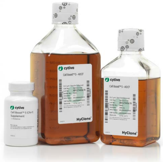
Fig 1. Cell Boost 5 supplements are chemically defined and animal-derived component-free.