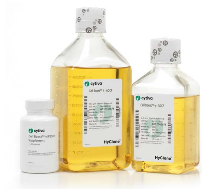
Fig 1. Cell Boost 4 supplements are chemically defined and animal-derived component-free.