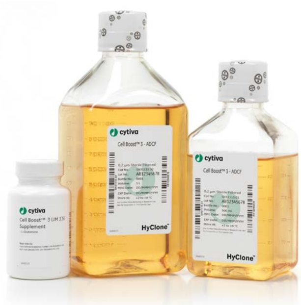
Fig 1. Cell Boost 3 supplements are chemically defined and animal-derived component-free.