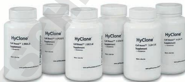
Fig 1. Cell Boost 2 Supplement is chemically defined and animal-derived component-free.