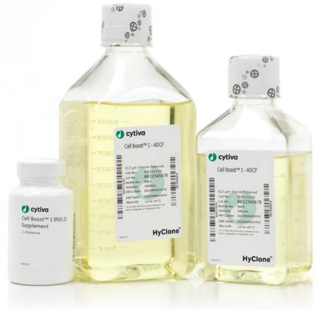
Fig 1. Cell Boost 1 supplements are chemically defined and animal-derived component-free.