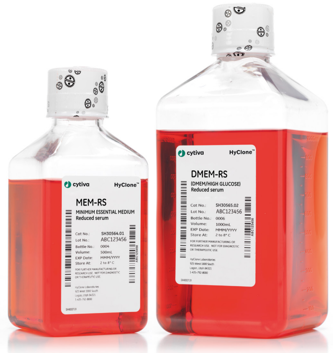
Fig 1. DMEM-RS and MEM-RS media enable reduced serum use in cell culture applications.

As all HyClone classical medium products, DMEM-RS and MEM-RS media are system tested with HyClone serum products. Use of system tested products reduces variability in culture caused by serum lot-to-lot variation, allowing for consistent and reproducible results.