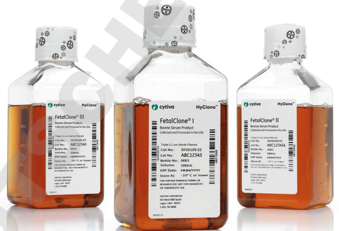
Fig 1. FetalClone engineered serum products show equivalent performance to FBS at a reduced cost and without limitation in supply.

Sera should be stored at -10°C or lower. Once thawed, sera should be stored at 2°C to 8°C. To maintain quality, a conservative storage recommendation for sera at this temperature is no longer than six weeks. If the serum needs to be stored longer than six weeks after opening, it is recommended to aliquot the serum into convenient volumes and refreeze.