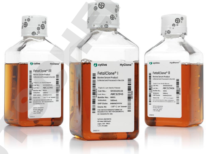
Fig 1. FetalClone engineered serum products show equivalent performance to FBS at a reduced cost and without limitation in supply.

Sera should be stored at -10°C or lower. Once thawed, sera should be stored at 2°C to 8°C. To maintain quality, a conservative storage recommendation for sera at this temperature is no longer than six weeks. If the serum