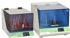
Transparent Acrylic Lid to view inside

Low temperature setup upto 128 below ambient. Auto Defrost Function keeps low temperature stable avoiding freezing in refrigerants.