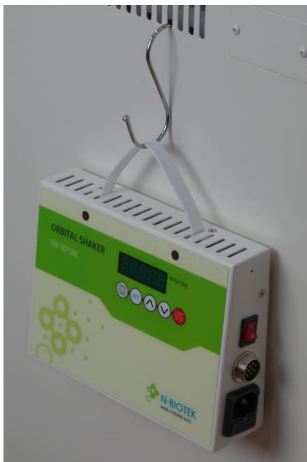
<Hanging with Hook>

*Insert the both edge of plastic strap into vent hole of remote control box.