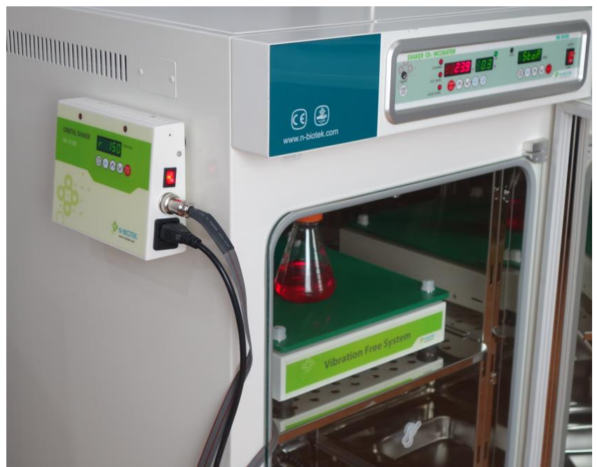
<Attachment with magnetics>