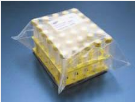
Filled racks simplify procedures