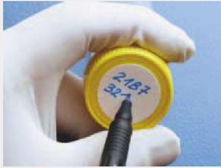
White marking circle, the TPP advantage