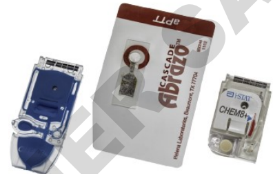
i-STAT is a registered trademark of the Abbott Group of Companies

Labcon's pettes are all compliant with the IVD Directive 98/79/EC and are lot tested Endotoxin (Pyrogen) Free.