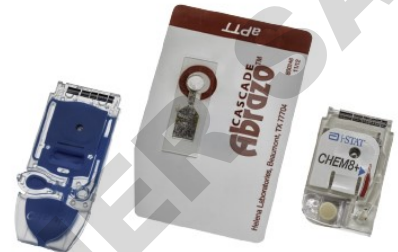
i-STAT is a registered trademark of the Abbott Group of Companies

Labcon's pettes are all compliant with the IVD Directive 98/79/EC and are lot tested Endotoxin (Pyrogen) Free.