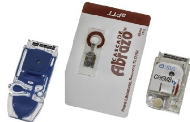
i-STAT is a registered trademark of the Abbott Group of Companies

Labcon's pettes are all compliant with the IVD Directive 98/79/EC and are lot tested Endotoxin (Pyrogen) Free.