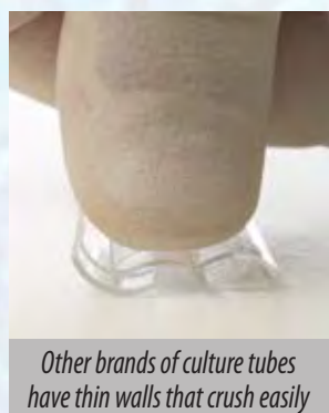
Other brands of culture tubes have thin walls that crush easily