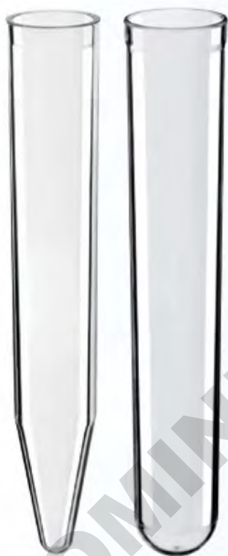
12 x 75mm, Conical