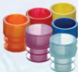
Colored plug-type caps for 13x100mm and 12x75mm tubes