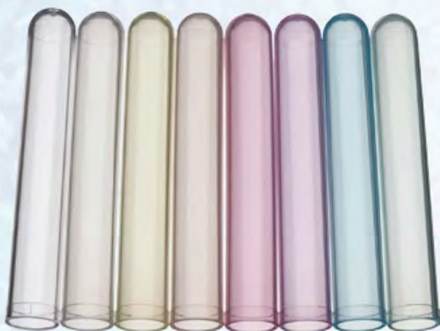
Labcon SuperClear™ tubes are clear enough to see color gradients. Polypropylene tubes available in colors.