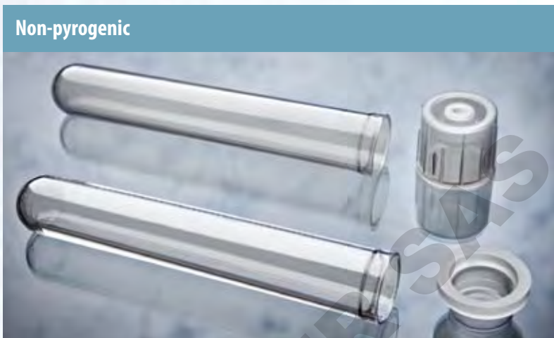
13x100mm and 17x100mm Round Bottom tubes with dual position and plug-type caps.