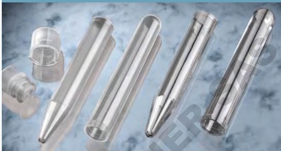
12x75mm Round Bottom and Conical tubes with dual position or plug style caps.