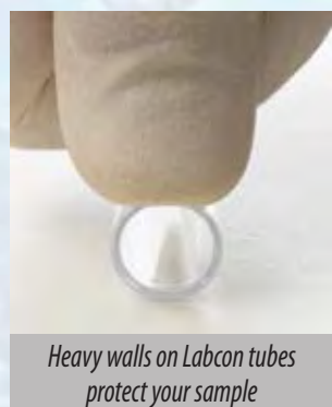
Heavy walls on Labcon tubes protect your sample