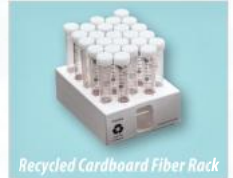
Recycled Cardboard Fiber Rack