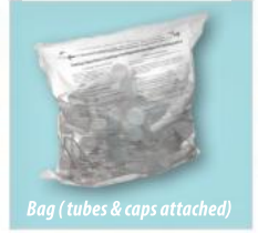
Bag (tubes & caps attached)