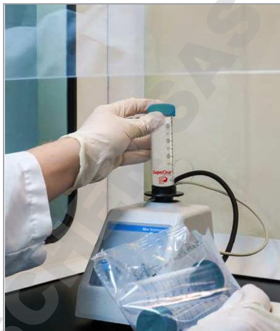
SuperClear® flat caps are leak-resistant and keep your sample secure while using a vortexer or rocker.

PLUG CAPS: offers a secure seal for extended storage. Plug caps do not include elastomeric sealing ring, but still feature a very deep sealing area.