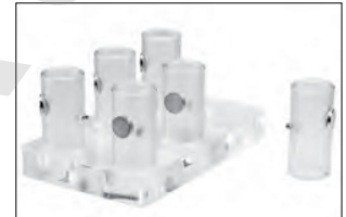
Magnetic Bead Separation Rack for 1.5-2ml Centrifuge Tubes catalog number #F19900-0002