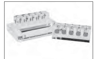
Magnetic Bead Separation Rack for 96-well Conical-Bottomed Plates catalog number #F19900-0003