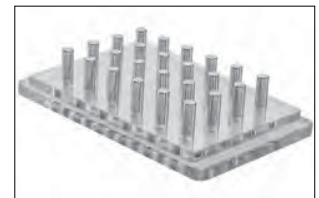
Magnetic Bead Separation Rack for 96-well Flat-Bottomed Plates catalog number #F19900-0004