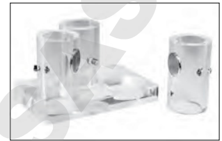
Magnetic Bead Separation Rack for 5-15ml Conical Tubes catalog number #F19900-0001