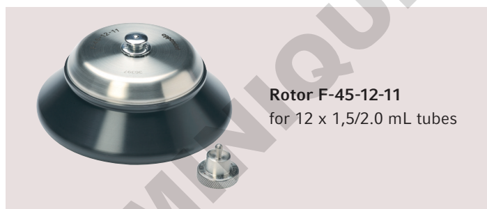
Rotor F-45-12-11 for 12 × 1,5/2.0 mL tubes