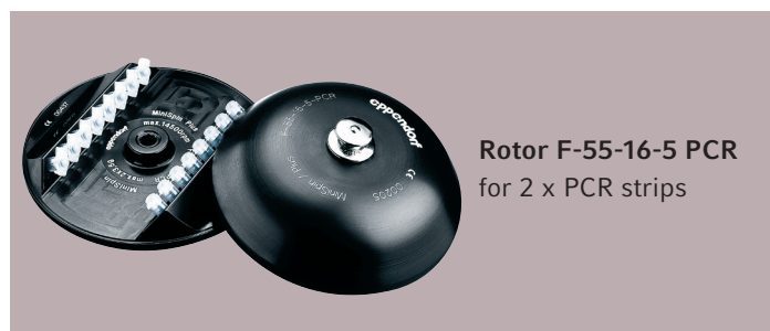
Rotor F-55-16-5 PCR for 2 × PCR strips