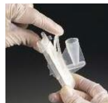
Clip top of funnel and base together.