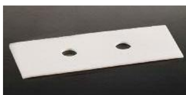
Filter Card for Shandon Reusable TPX Single Sample Chamber