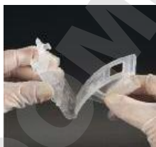
Insert funnel into base.