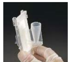
Your CytoSep ALL PLASTIC Cytofunnel is now ready to use.