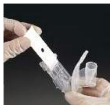
Place new filter onto microscope slide.