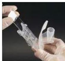
Insert microscope slide.