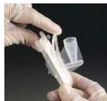
Clip top of funnel and base together.