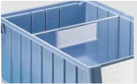
A Cross dividers