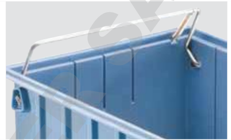
C Carry/safety handle