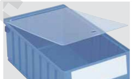
F Dust covers