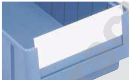
E Label covers