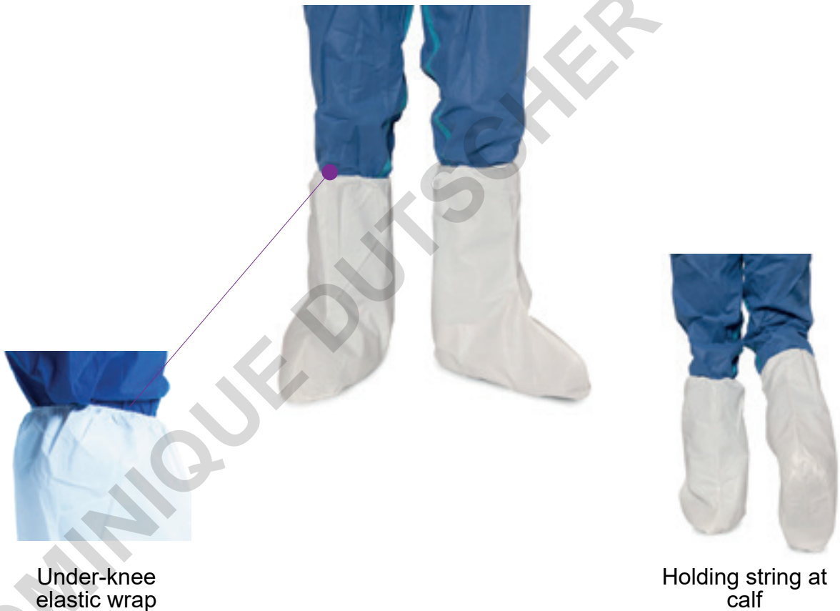
Under-knee elastic wrap