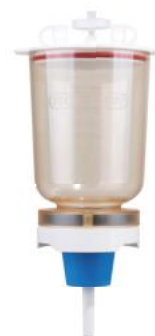
Rocker, 500 ml MF 5, Magnetic Filter Holder (200500-01)