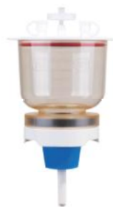
Rocker, 300 ml MF 3, Magnetic Filter Holder (200300-01)