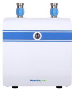
WaterVac 200 (190200-01/02)(US plug / EU plug)

We can offer customized adaptor for your funnel