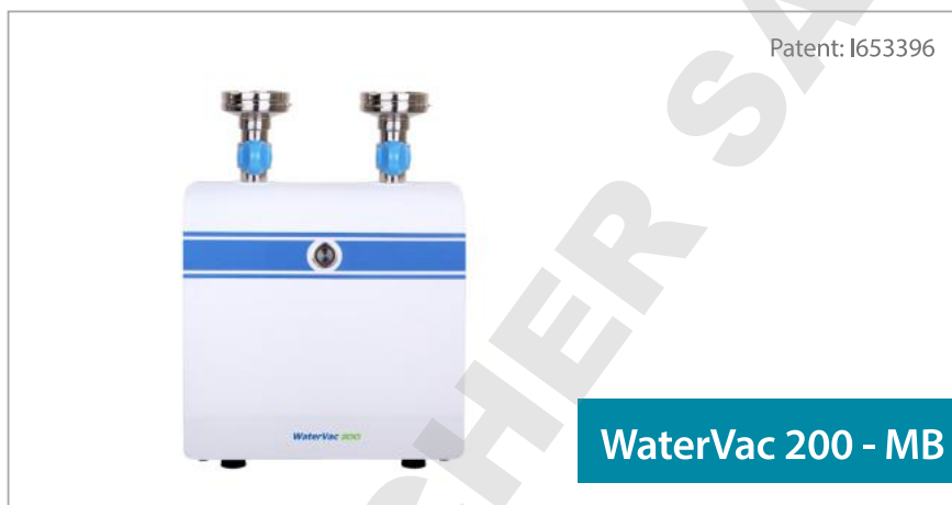
WaterVac 200 - MB