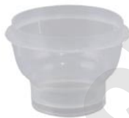
Sartorius, 100 ml / 250 ml Microsart® disposable plastic funnel (16A07--10---N/ 16A07--25---N)