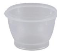
Pall, 100 ml / 250 ml Sentino® disposable plastic funnel (4870 / 4871)