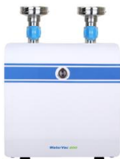
WaterVac 200 - MB (190220-01/02)(US plug / EU plug)