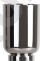
Rocker, 500 ml SF Stainless Steel Funnel (180100-05)