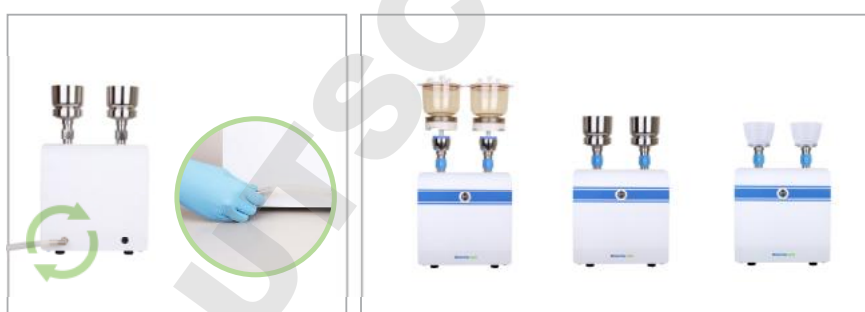
360° Rotational L-type hose barb