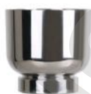
Rocker, 300 ml SF Stainless Steel Funnel (180100-03)