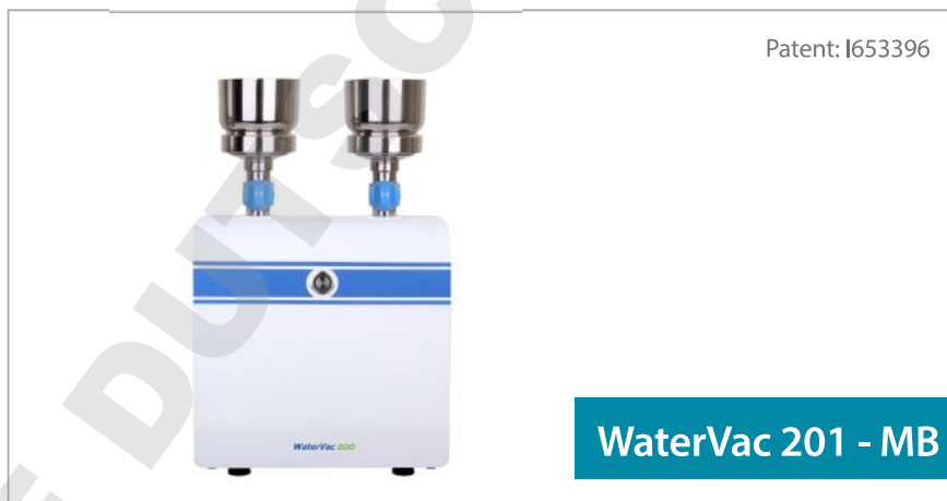
WaterVac 201 - MB