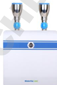
WaterVac 200 - MS (190210-01/02)(US plug / EU plug)