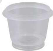
Millipore, 100 ml / 250 ml Microfil® disposable plastic funnel (MIHAWG100 / MIHAWG250)