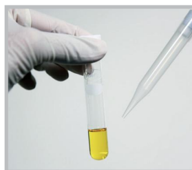
1. Pipet 2.00 ml sample into a COD vial