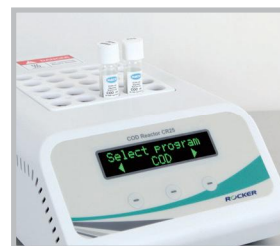
2. Heat the vial for 2 hours at 150°C