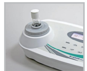
3. Detect the reagent vial to get COD value