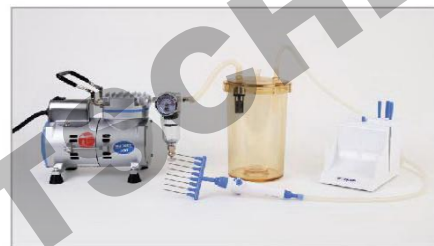
Rocker 300 - BioDolphin

According to laboratory requirements, BioDolphin can be used with various types of vacuum pump / suction system like Rocker 300 - BioDolphin , Protatable Suction System BioVac 225 - BioDolphin , Lafil 400 - BioDolphin .