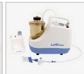
Lafil 400 - BioDolphin