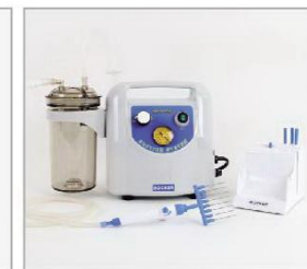
BioVac 225 - BioDolphin