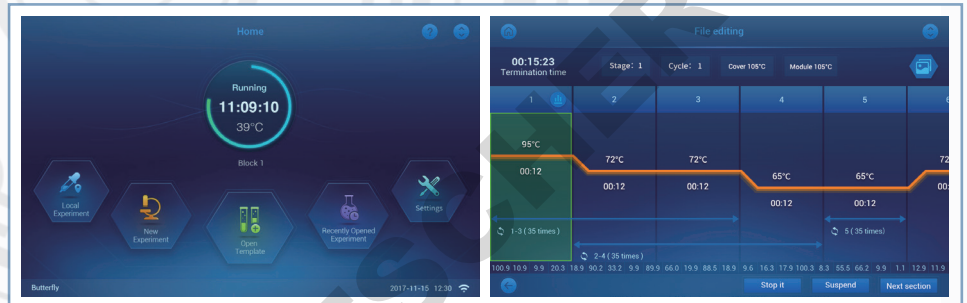
Operation Interface on Device