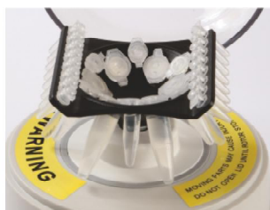
02 Mini-6KS 3-in-1 rotor