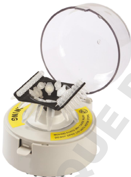
Mini-6KS Patented 3-in-1 rotor design