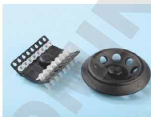
01 Mini-6KC quick release rotor