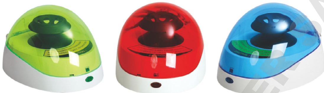
Mini-6K / Mini-7K / Mini-10K