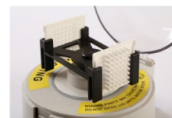
05 Mini-6KT 48-well 50ul PCR plate rotor