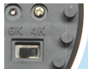
04 Mini-6KC/Mini-6KS/Mini-6KT Two speed options