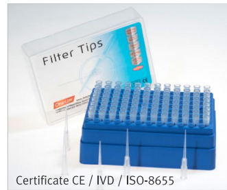
Certificate CE / IVD / ISO-8655