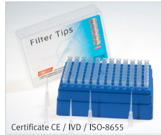
Certificate CE / IVD / ISO-8655