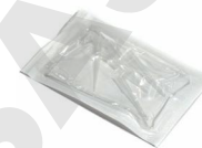
Example of tips in blister of 5 pcs