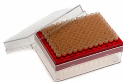
Example of tips in rack 0 - 200 µl