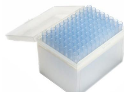
Example of tips in rack 200 - 1000 µl