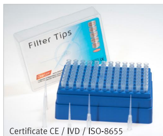
Certificate CE / IVD / ISO-8655