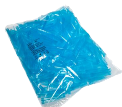
Example of tips bag

Several tip models utilizable with the most important pipette brands of the market. Available in bulk and rack both. Made of Polypropylene Autoclavable racks