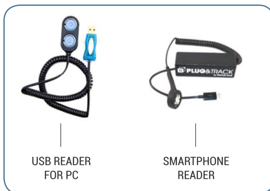
USB READER FOR PC