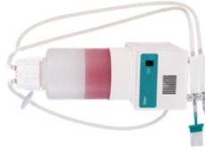
Automatic Aspiration System

Incl. quick lock connection, 1x 3m hose with HEPA filter and required closures for the bottle, handle with accessories: Luer Lock 90° angle adapter, 1x adapter for a diameter of 6.6 mm hose and 1x adapter for a 6 mm hose, 1 Luer Lock metal connector with hose to connect optional accessories. Type AA-24 is supplied with 1 extra handle (with accessories) and a Y-distributor.