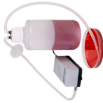
Compact Aspiration System

Incl. quick lock connection, 1x 3m hose with HEPA filter