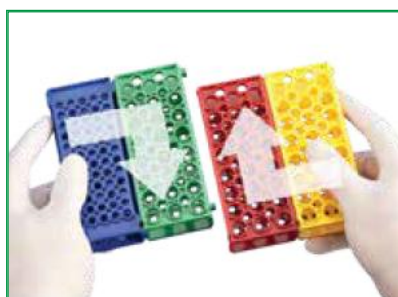
Slip and lock the racks together.