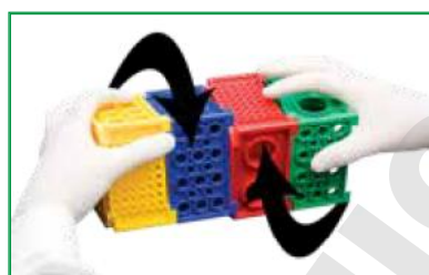
Revolve to create the perfect workstation.