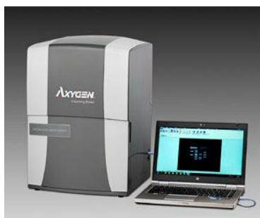
Axygen Gel Documentation System

Axygen® Gel Documentation systems easily capture publication quality, 16 bit TIFF images. The systems are quick to set up and have an intuitive user interface for image capture, annotation, and contrast adjustment. Images are easily saved and opened in common gel analysis software for more detailed analysis.