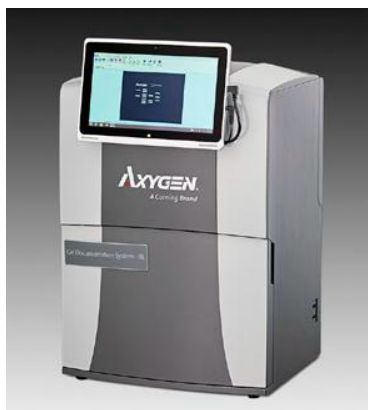
Axygen Gel Documentation System-BL