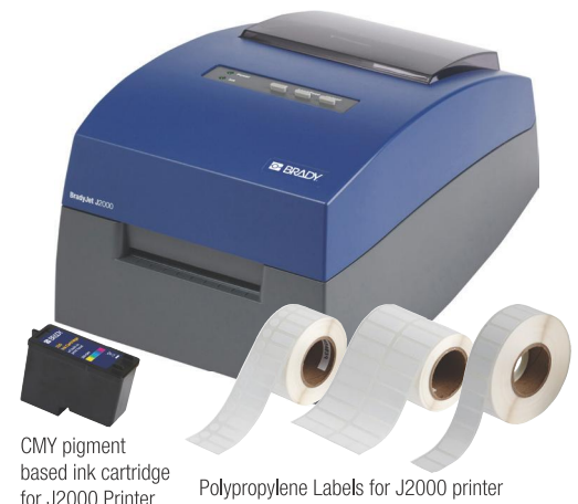
CMY pigment based ink cartridge for J2000 Printer