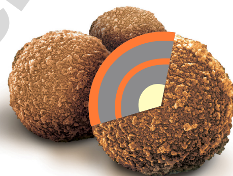
Fig 1. SEM image showing the cauliflower-like surface of the Sera-Mag Speedbeads that dramatically increases the overall surface area available for binding. Sera-Mag SpeedBeads also have a second layer of magnetite within the particle, resulting in a 2×-faster increase in speed in response to magnetic field.