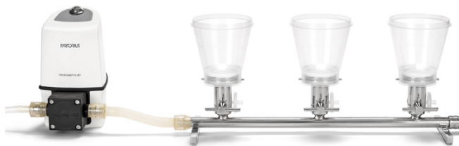
Microsart® Manifold with Biosart 250 Funnels and Microsart® eJet Pump (Pump and Funnels are not included in the delivery content)