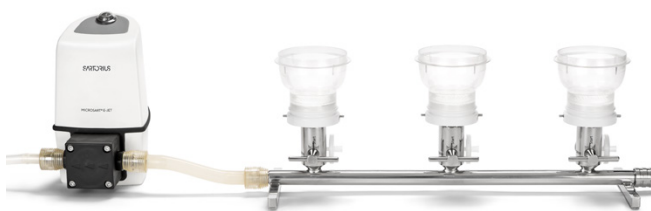
Microsart® Manifold with Microsart® @filter units and Microsart® e.jet Pump (Pump and Filtration units are not included in the delivery content)