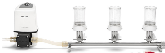
Microsart® Manifold with Biosart® 100 Monitors and Microsart® eJet Pump (Pump and Monitors are not included in the delivery content)