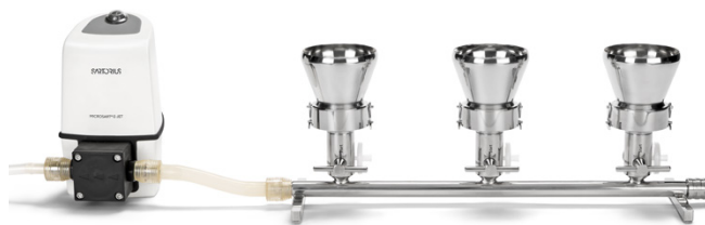
Microsart® Manifold with 100 ml Stainless Steel Funnels and Microsart® e.jet Pump (Pump is not included in the delivery content)