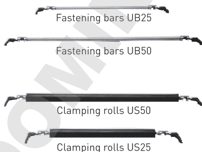
Fastening bars UB25