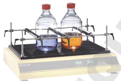
LS500 + UA5

Fastening bars and clamping rolls which can be easily attached to the vertical rods on the shaker at the desired height. The clamping rolls, covered with Neoprene cushioning, then run between these two bars thus allowing a wide range of vessels to be safely attached.