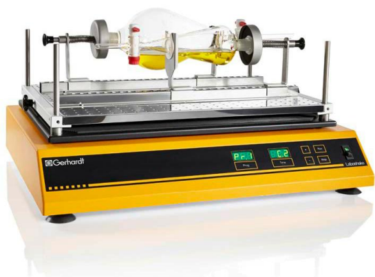
Shaker LS500 + Universal plate + Holder for separatory funnels

Sturdy, reliable laboratory shaker in tried and tested C. Gerhardt quality, with linear or circular motion, for all shaking tasks in chemical, biological or microbiological laboratories.