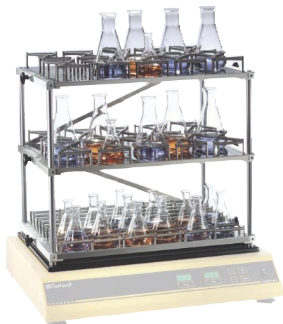
LS500 + EA3 + 3xTB52

Easy-to-assemble kit for space-saving simultaneous shaking of 2 or 3 plates. Can take up either TB51 and TB52 finished plates or TB50 universal plates equipped as desired for shaking Erlenmeyer flasks.