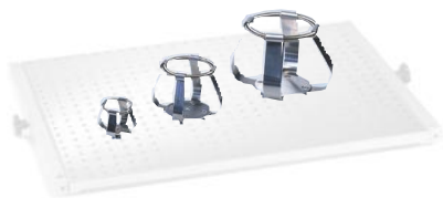
TK50 - TK250 - TK500

Any number of clip racks TK for Erlenmeyer flasks from 25 ml to 2000 ml can be mounted on the universal plates.