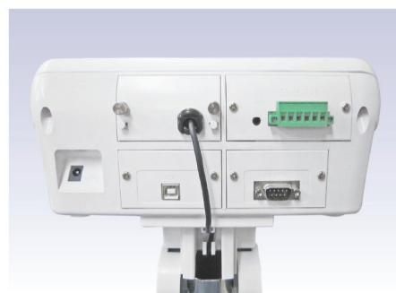
Display unit with HVW-02CB, HVW-03C, and HVW-04C

* 7 For communication with a PC only. The driver software can be downloaded for free.