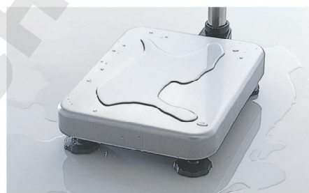
IP65 base unit with a SUS430 pan

The base unit can be washed with water, not to mention that wet objects can be weighed with no problem. Further, the surface of the pan is resistant to chemicals, scratches and rust, and easy to keep clean and hygienic.