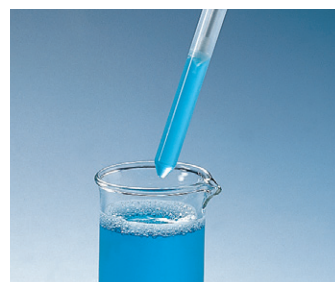
Positive displacement principle

Media which tend to foam, such as tenside solutions, pose no problem to the Transferpettor.