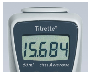
Precise working within the Class A error limits