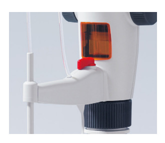
Light protection window for light-sensitive media