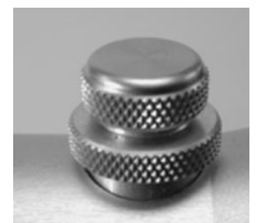
Turn to adjust