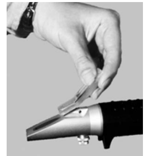
Replacing the illuminator flap

Should the illuminator plate become damaged or lost, simply replace it by clipping a new one in place.