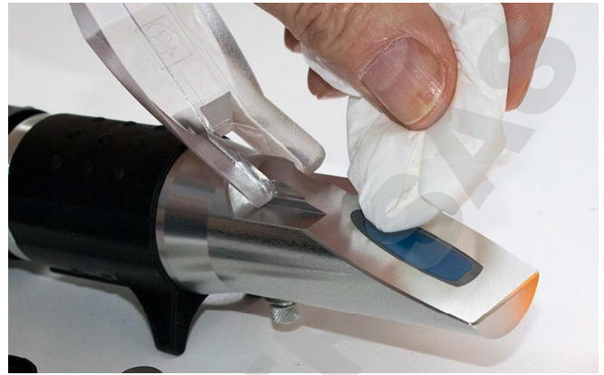
Clean the prism with water and a clean tissue or cloth

The prism surface could be damaged by strong alkalis or acids if left in contact for long periods of time.