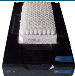
Racked cryogenically frozen tubes are scanned.