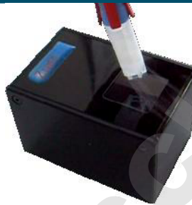
After repeated scanning, no condensation forms.