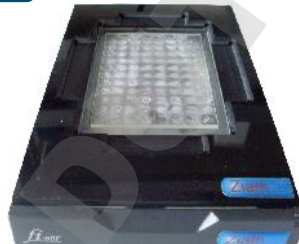
Without Cryoprotection™. Visible condensation.