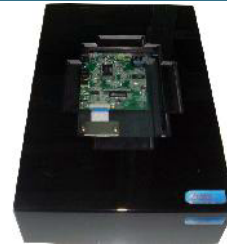
With Cryoprotection™. No condensation forms.