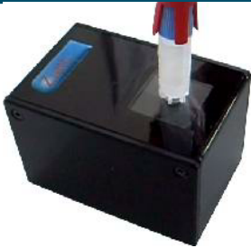
Cryogenically frozen tube scanned.