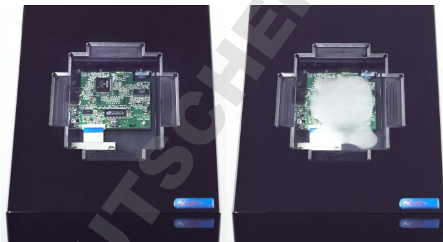
DataPaq™ High Speed scanner with Cryoprotection™

As Ziath's method for eliminating condensation uses a special coating on the scanner window, no extra electrical components are required. This increases reliability and significantly decreases the cost. Additionally, some manufacturers use fans to remove the condensation, which could unnecessarily speed up the thaw-rate of precious samples.