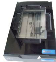
With Cryoprotection™. No condensation forms.