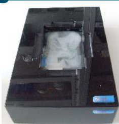
Without Cryoprotection™. Visible condensation.