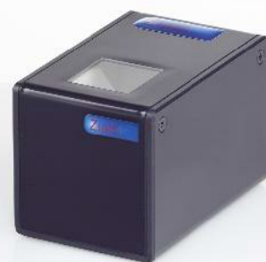
DataPaq Single Tube Scanner with Cryoprotection™. No condensation has formed