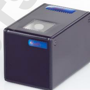
DataPaq Single Tube Scanner without Cryoprotection™. After repeated scanning, condensation starts to appear