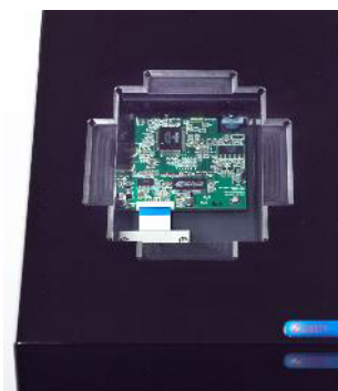
Scanner with Cryoprotection™