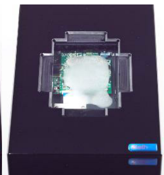
Scanner without Cryoprotection™