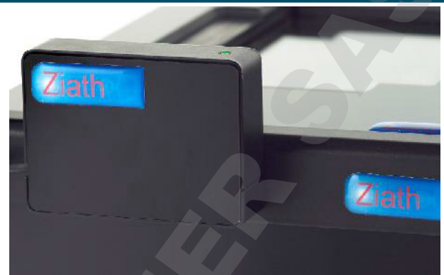
The DataPaq™ Linear Barcode Rack Scanner is easy to install and use.