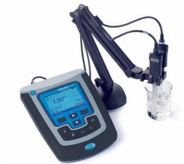
HQD benchtop multi-meter