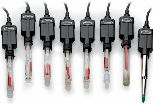
PHC705 PHC805 PHC725 PHC735 PHC705A PHC745 PHC729 PHC108

Full specifications of the electrodes featured in the table are available on our website or you can call your local office.