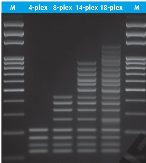
Multiplex amplification of different genes from human gDNA. Amplicons ranging from 122 bp to 1340 bp in size.